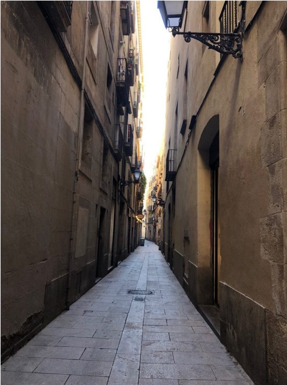
Figure 7. Barcelona city, Catalonia (Spain) (v): Streetwise, Gótico neighbourhood.