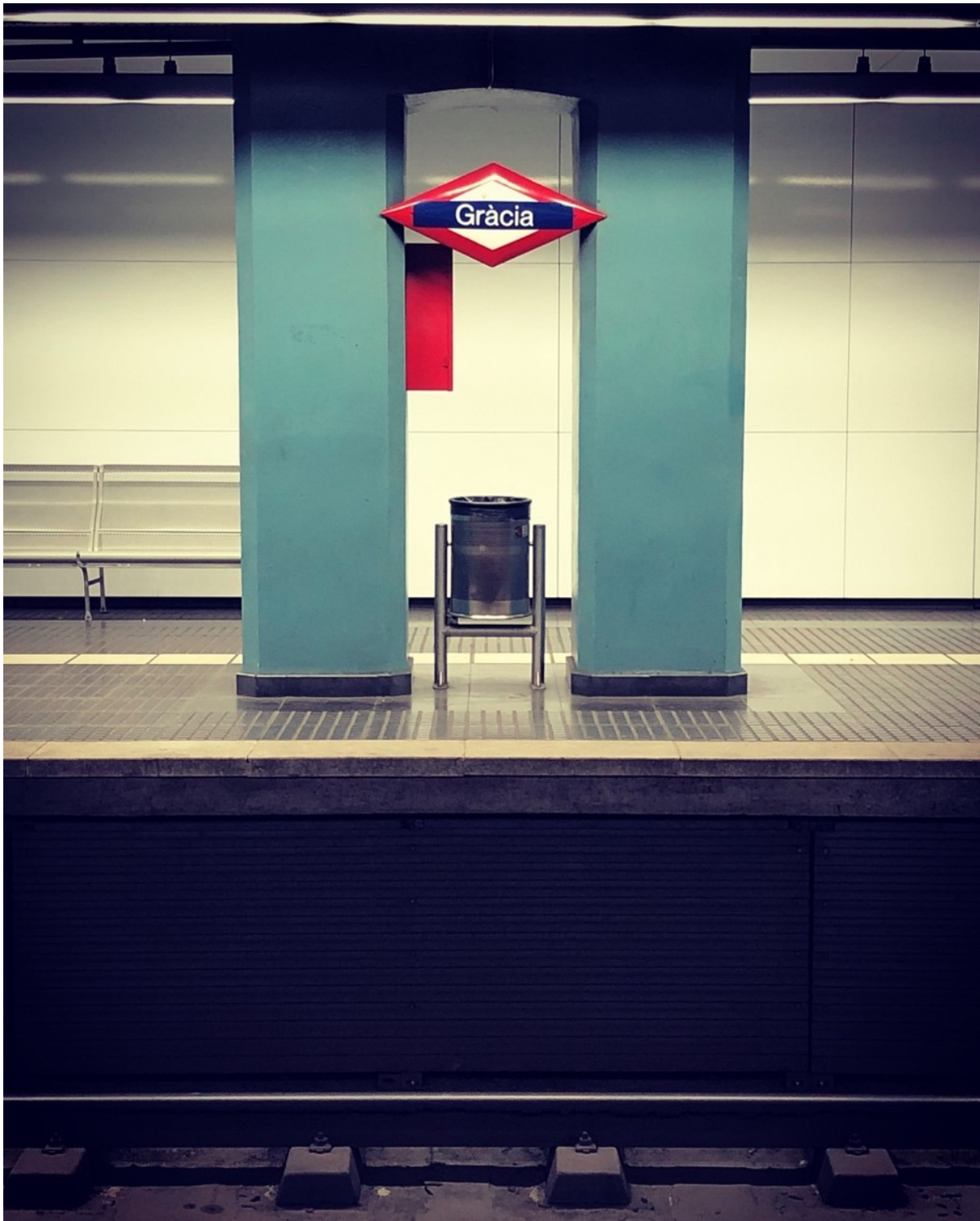
Figure 6. Barcelona city, Catalonia (Spain) (iv): Underground, Gràcia tube station.