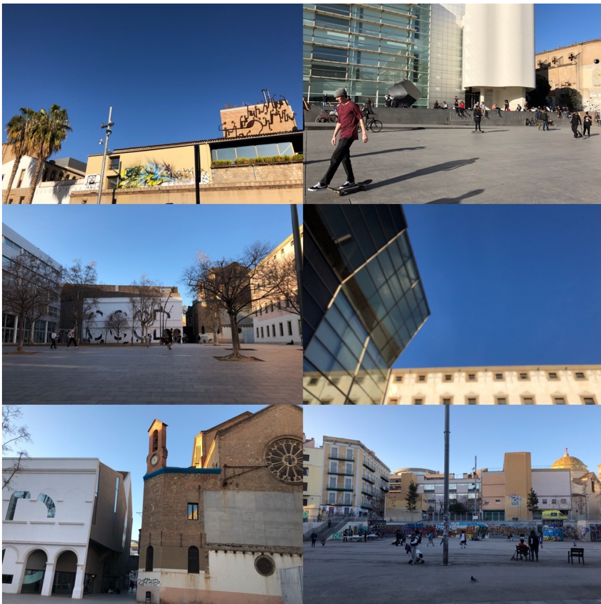
Figure 3. Barcelona city, Catalonia (Spain) (iii): Streetwise, El Raval, CCCB.

explicitly addressing citizens' needs rather than market demands alone; (ii) considering citizens as relevant actors, for example by giving them control of their personal information and letting citizens participate and collect data to use for policy-making; and (iii) using data to produce public value or urban commons (Bigo et al. 2019; Keith and Calzada 2018). Hence, technological sovereignty in European cities like Barcelona may have contributed to questioning the following aspects of: First, could cities and regions in Europe build the kind of alternatives that would put citizens back in the driver's seat as decision-makers rather than data providers? Second, should cities and regions in Europe focus on building decentralised infrastructure like blockchain ( www.ledgerproject.eu ; www.eublockchainforum.eu ; Allesie et al. 2019)?