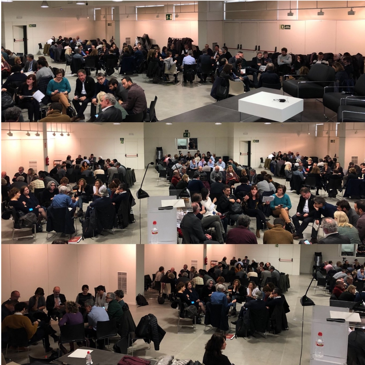
Figure 4. Board of Directors of the Barcelona City Council in the launching and participatory event of the City Data Analytics Office (#DataCommons) (Barcelona, 17 th January 2018).

decide on the possibility of reproducing governance frameworks and technological artefacts that do not abuse citizens' data by respecting them, working instead to tackle real (not only commercial) problems based on open codes. Thus, this notion of sovereignty is far from other notions like protectionism or 'technological nationalism' (clearly being deployed by China) that attempt (absurdly) to develop territorially-bounded and politically-predetermined technological infrastructures.