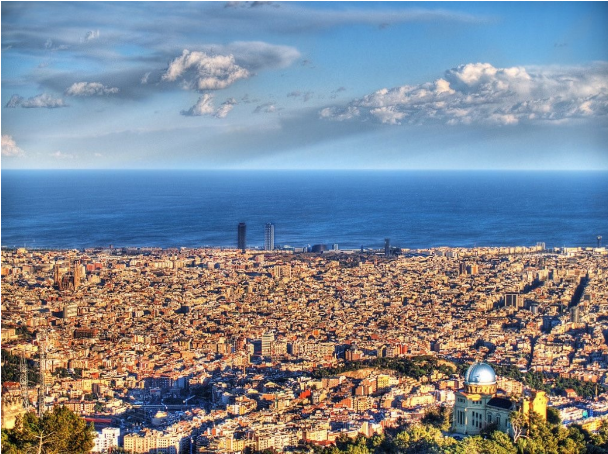
Figure 1. Barcelona city, Catalonia (Spain) (i): At a glance