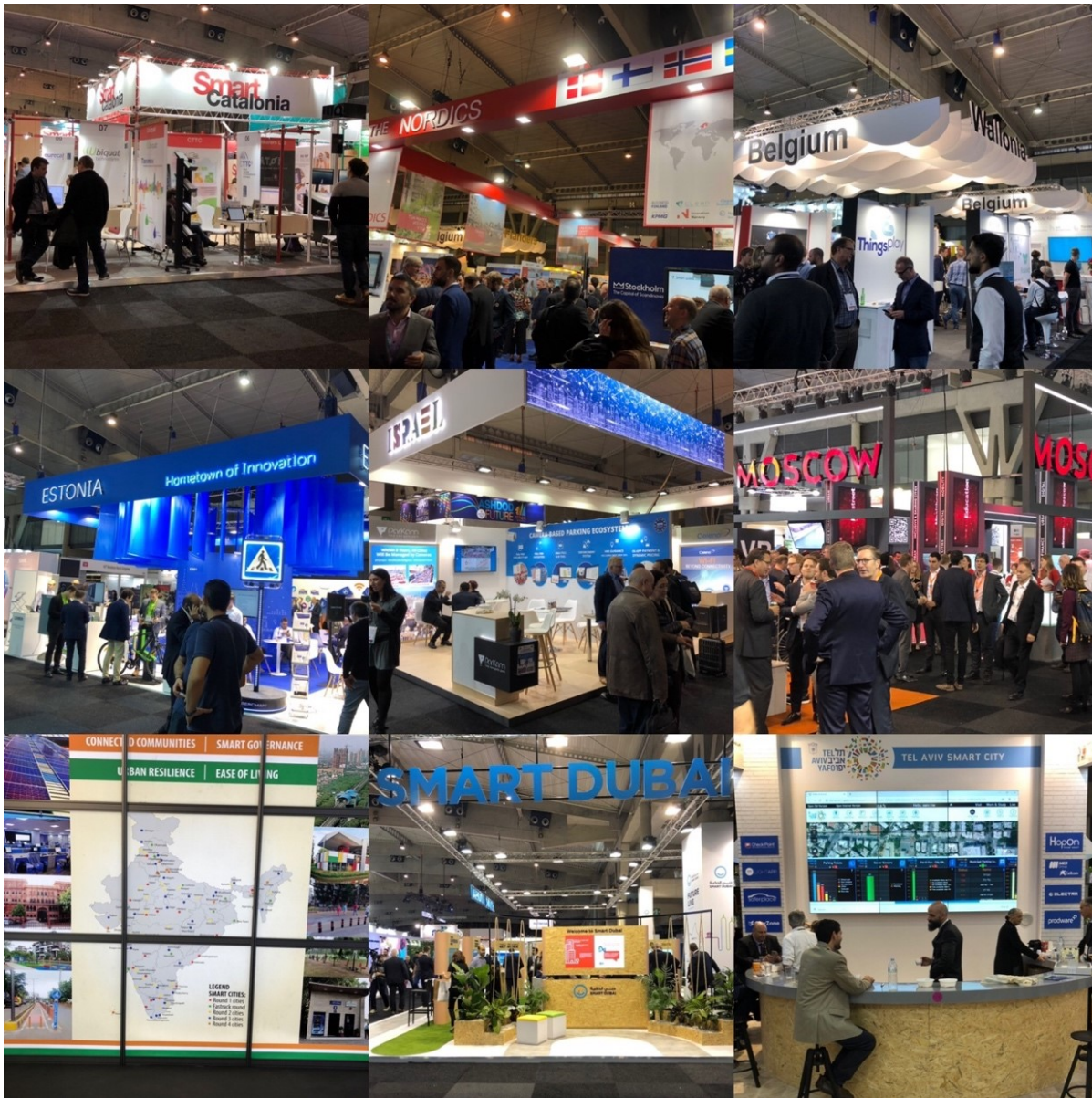
Figure 5. Smart City Expo World Congress 2018 (#SCEWC18). Cities and regions' stands (Barcelona, 15 th November 2018).