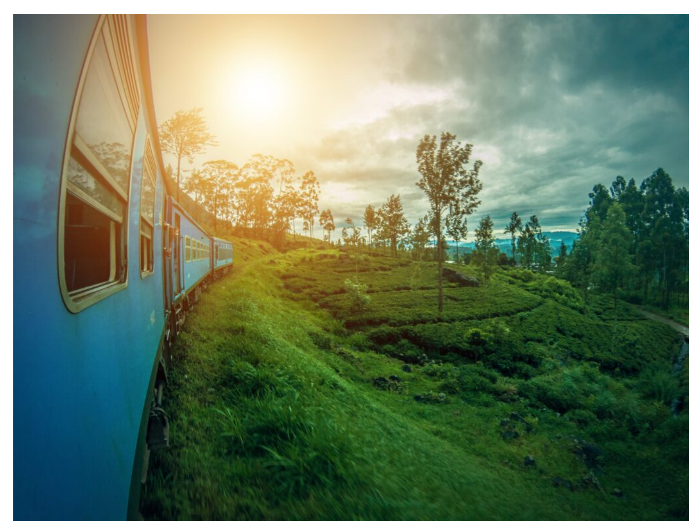
By Mariia Rastvorova (email).

I felt the vibes of sustainability/sustainable tourism right from the start of the conference. Instead of providing a printed conference program, the RSA provided participants with a very easy-to-use mobile conference app containing information on academic, networking and entertainment activities, maps and more. The paper conference badge was simultaneously a bus ticket allowing delegates free public transport during the conference.