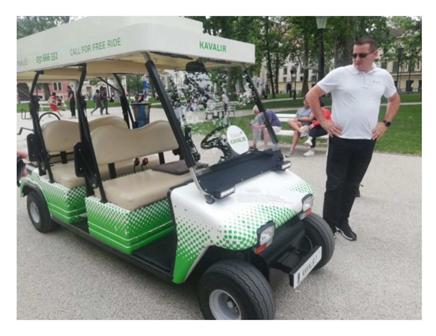
Figure 4.2 A Gallant Ljubljana Kavalir with his car ready to help everybody!