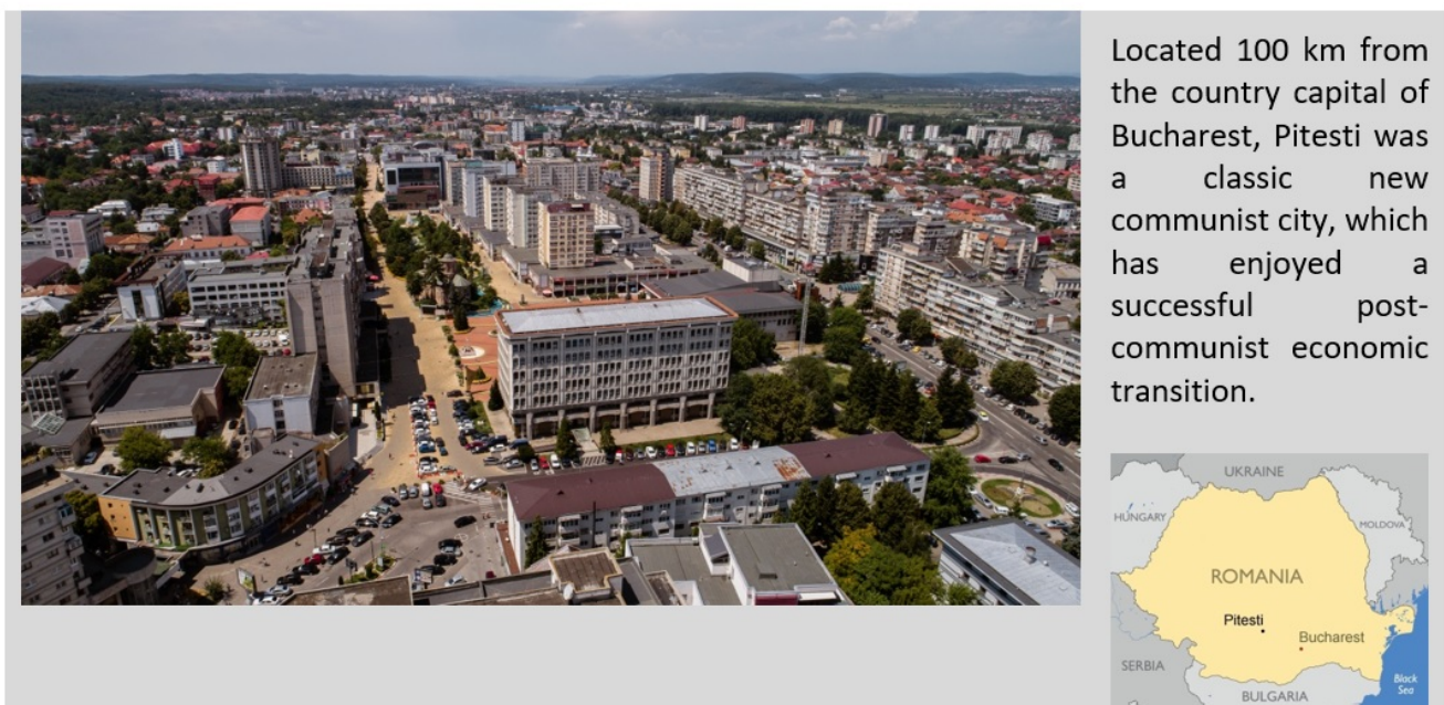
Figure 1. Pitesti, Romania