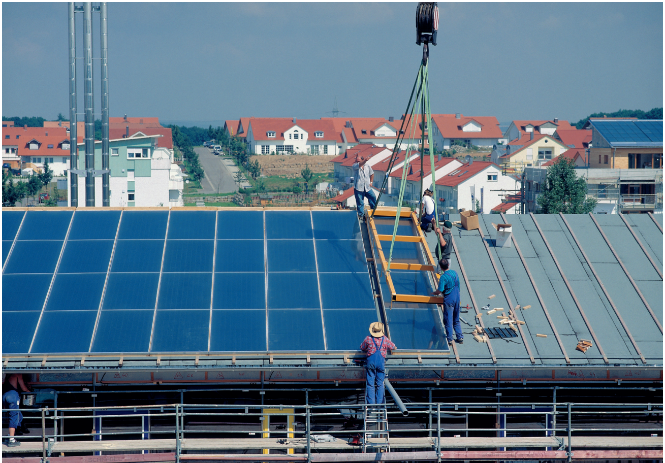
Figure 2: Construction workers installing PV systems

through installations) will remain in the region. It is now up to policymakers to drive forward the combination of supply and demand-side eco-innovation policies in such a way that regional lead markets emerge and both ecological and economic goals are met. In this respect, regional demand-side policies are lacking in sectors that Baden-Württemberg already promotes in its supply-side innovation policy, such as sustainable mobility, bioeconomy or circular economy.