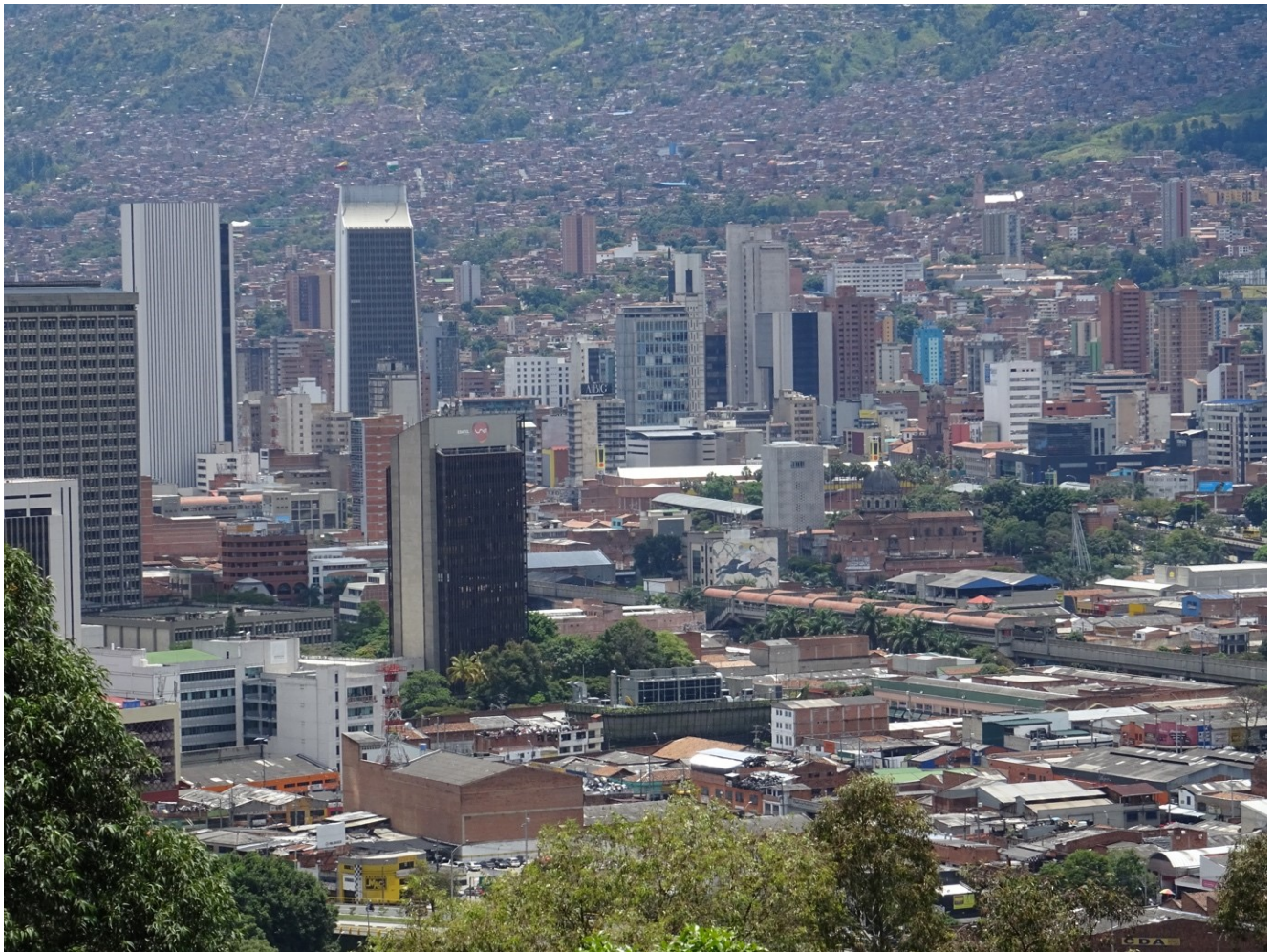
Figure 2. Medellín's City Center from Nutibara Hill.

At the center of Medellín's transformation is the Grupo Empresarial Antioqueño , which acted as institutional entrepreneurs to influence policy interventions. The GEA, a keiretsu-like conglomerate where companies have cross-ownership, was formed in the late 1970s to protect regional companies from hostile takeovers by industrialists from outside Medellín. The GEA's most ambitious strategy to promote innovation activities in the city was in participating in the creation of Ruta N in 2009, an innovation agency to implement the science, technology and innovation plan for 2011-2021. The innovation agency, which is receiving funding from the City of Medellín through the municipally-owned, multi-utility company EPM-UNE, was incubated at Proantioquia, the GEA's philanthropic organisation.