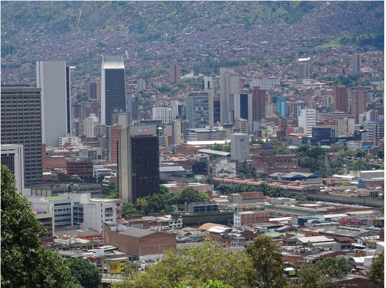
Figure 2. Medellín's City Center from Nutibara Hill.

At the center of Medellín's transformation is the Grupo Empresarial Antioqueño , which acted as institutional entrepreneurs to influence policy interventions. The GEA, a keiretsu-like conglomerate where companies have cross-ownership, was formed in the late 1970s to protect regional companies from hostile takeovers by industrialists from outside Medellín. The GEA's most ambitious strategy to promote innovation activities in the city was in participating in the creation of Ruta N in 2009, an innovation agency to implement the science, technology and innovation plan for 2011-2021. The innovation agency, which is receiving funding from the City of Medellín through the municipally-owned, multi-utility company EPM-UNE, was incubated at Proantioquia, the GEA's philanthropic organisation.