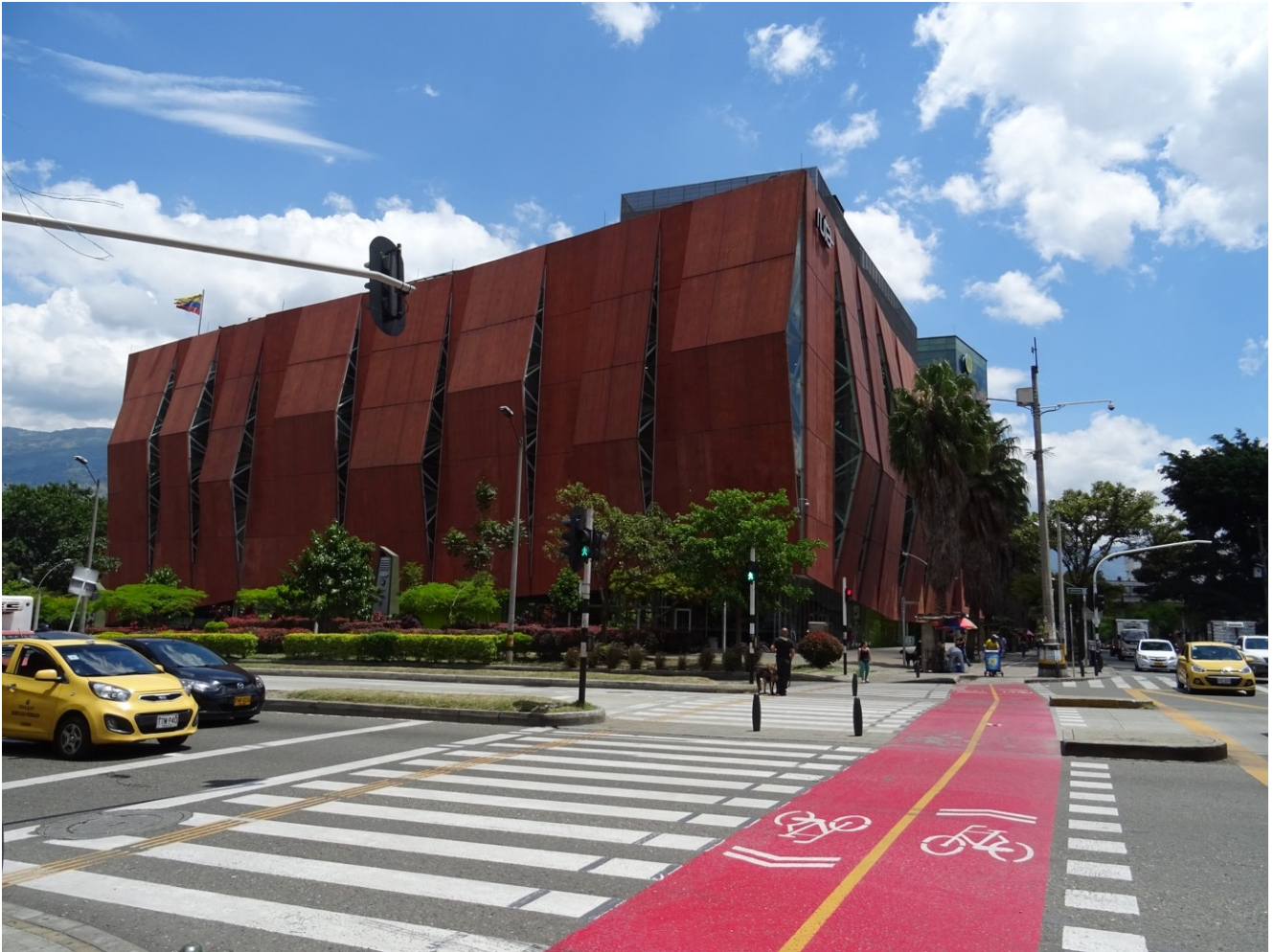
Figure 3. The Ruta N's building complex.