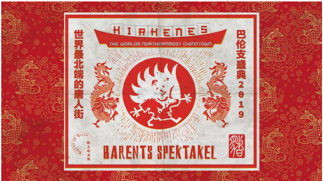
Graphic design for Barents Spektakel.

Reflecting the sea-change that has occurred in the Arctic in a short amount of time, the “Polar Chinatown” theme for the upcoming Barents Spektakel is a far cry from that of the first-ever event in 2005, when “Indigenous Peoples, National States, and Borders” took top billing. As recently as 1991, the Soviet Union’s Northern Sea Route was closed to foreign shipping. Today, given the passage’s increasingly oriental orientation, it’s becoming common to refer to it as the Polar Silk Road. Kirkenes has played a key role in that transformation from the beginning: the first vessel ever allowed to sail between two foreign ports via Russia’s Arctic shipping passage departed from its port, carrying 100,000 tons of iron ore from the local Bjørnevatn mine to Qingdao, China in September 2010.