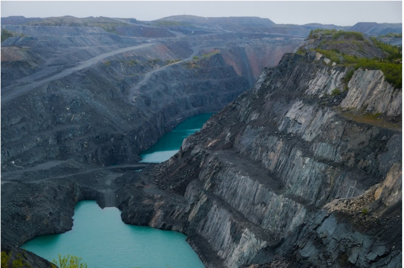
Sydvaranger Gruve's iron ore at Bjørnevatn, near Kirkenes, Norway.