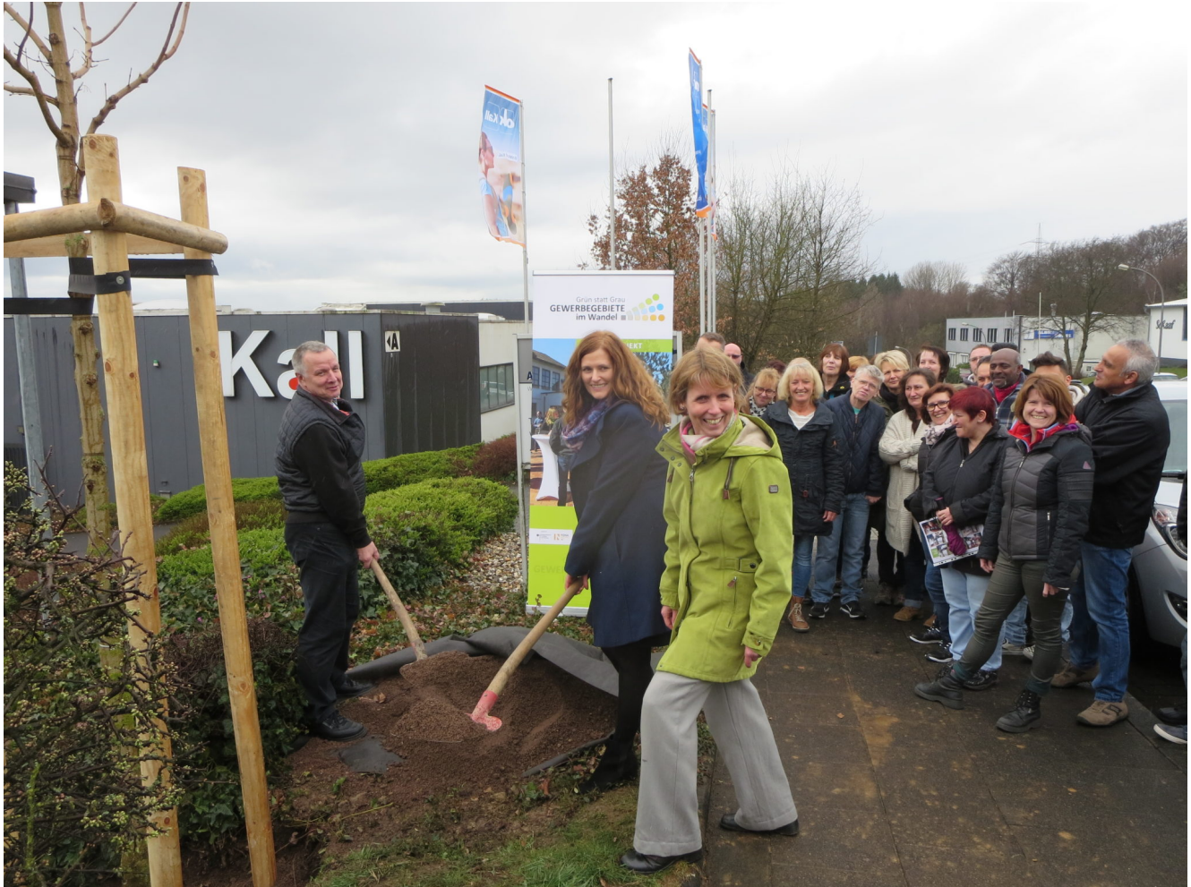
Figure 3. Tree planting.

When designing the network formats, it was important to consider appropriate targeting. For companies, it was promising to start with less complex activities, including events such as street festivals, business breakfasts, information desks (see figure 4). The evaluation of these meetings helped to build a variety of formats and design a campaign that fits the needs of the industrial park and the companies. The announcement of events via newsletter has been essential for good networking. Gradually, some formats and offers (e.g. monthly regulars' tables) have been established permanently so that the participants can adapt to them. The range of offers for the participating companies include free advisory services on energy efficiency, planning of outdoor facilities, use of renewable energies, electromobility, etc. Furthermore, the project offers individual consultations, which are carried out by the project partner Global Nature Fund.