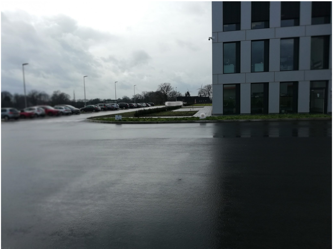
Figure 1. Industrial area in Lengerich, Germany, with high degree of soil sealing.

These aspects reduce the attractiveness of old industrial parks for companies and make it difficult to overcome existing and future challenges like the availability of land or climate change issues (BBSR, 2016). At the same time, attracting new firms, generating or securing jobs and the associated local business tax are still vital for municipalities' revenues. The Federal Institute for Research on Building, Urban Affairs and Spatial Development (BBSR) stressed that many municipalities consider renewal and sustainable transition of existing industrial estates as essential (BBSR, 2016). Moreover, the revitalisation and sustainable upgrading of old industrial parks is a key objective of Germany's National Sustainable