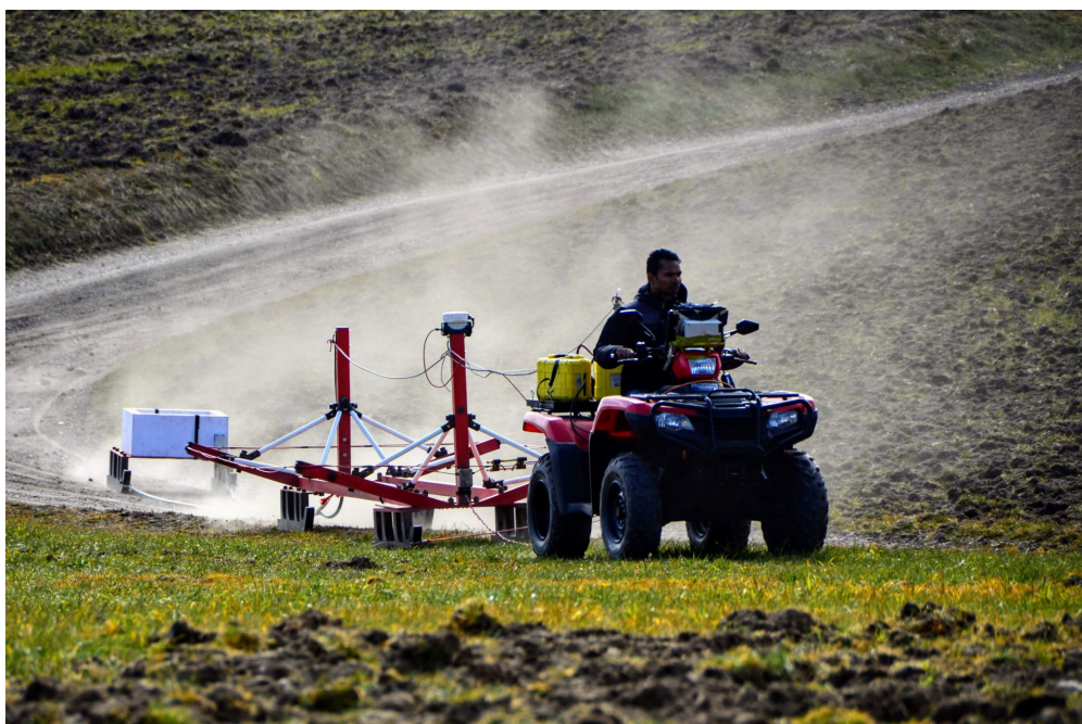
The tTEM system in action.

To build the knowledge base for soil and groundwater management, the Interreg North Sea Region project TOPSOIL has developed and tested new local and regional approaches. In contrast to many modelling projects, TOPSOIL always works in close cooperation with stakeholders and groundwater managers. Coupled with a high sensitivity toward governance issues, the local project pilots aim “to get things done” and implement solutions.