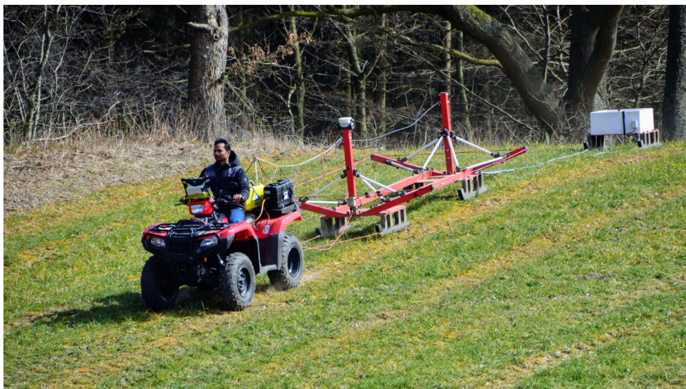
The tTEM system in action.

to decide on actions to reduce the risk of water pollution, keep valuable topsoil on fields, and limit the use of fertilisers. Compliance with FRW will also benefit groundwater quality.