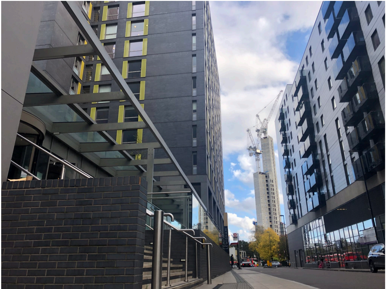
Figure 2. Chapter Living student accommodation in Lewisham, London, part of the densification scheme for the area.

Global institutional investors have the weight of capital and the capacity to facilitate the development and longer-term investment into the PBSA sector in key university cities. Manchester and London are seen as strong and resilient markets with attractive yields and the potential for market monopolies. After all, large players seem to dominate the PBSA market, making financialisation processes more apparent. The current pandemic has further exposed the issue and the wider consequences of the financialisation of student accommodation, creating pressures on universities and their operation. However, some universities see the provision of accommodation by PBSA as one less cost for them to bear and