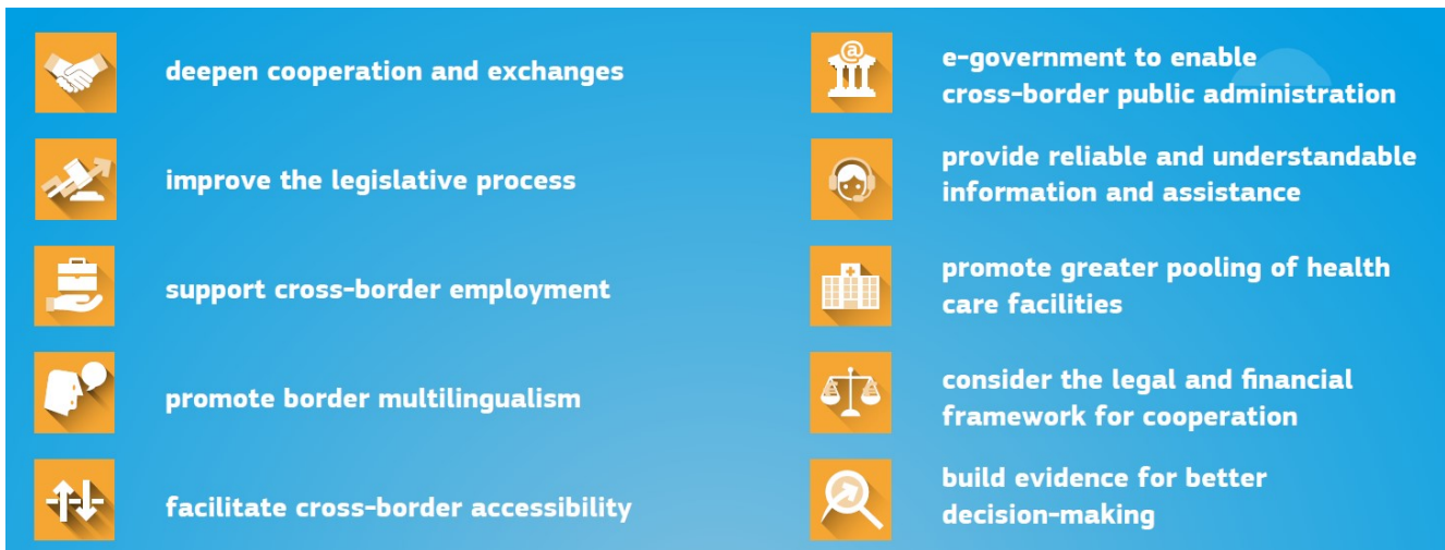
Figure 2. Thematic areas addressed by EC Communication.

Review highlighted as those needing urgent intervention, as illustrated in Figure 2: