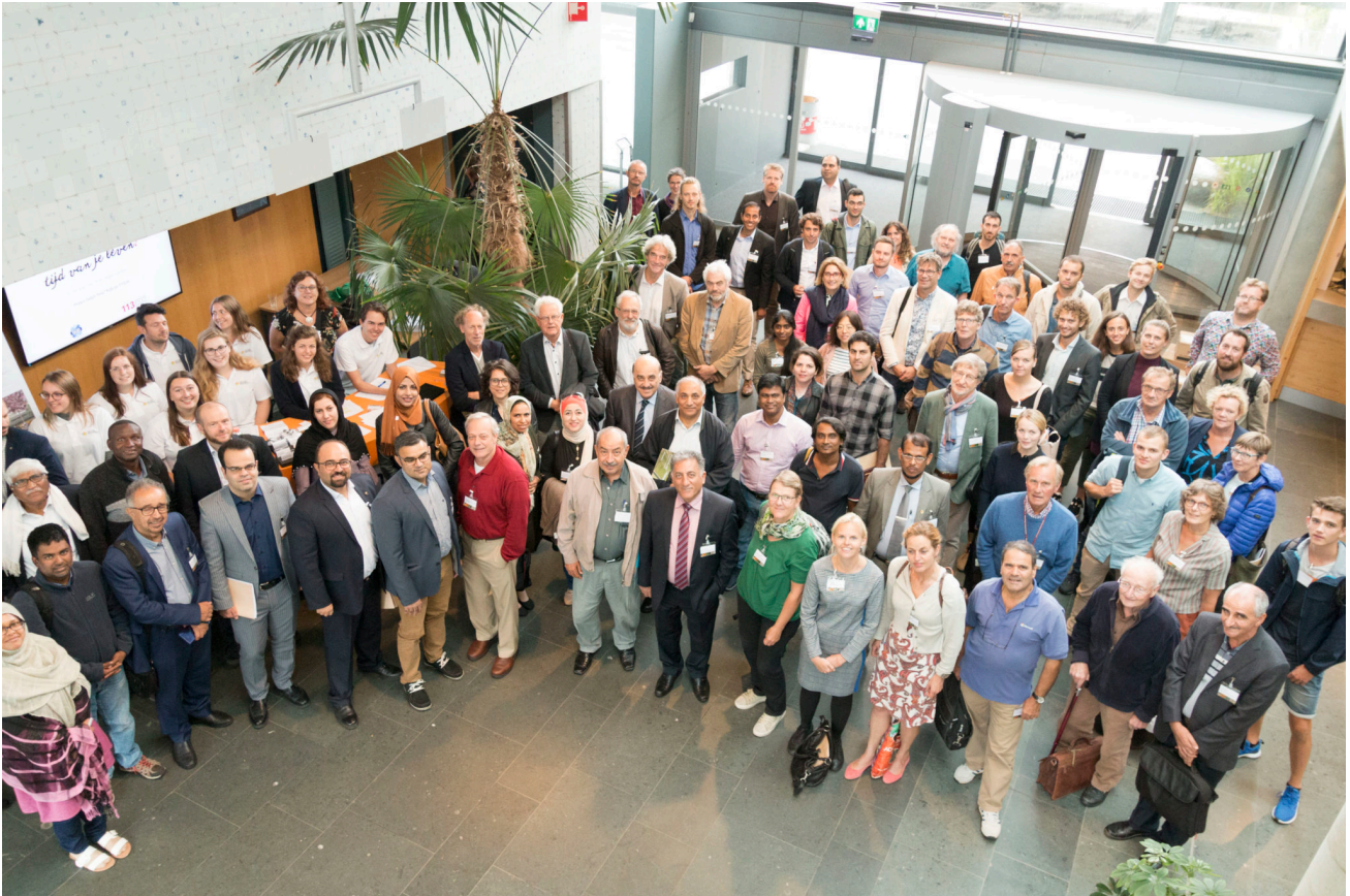
Participants at the conference

The event covered a broad range of themes, from revitalising saline lands to promising crops and governance. More information including streamed keynote speeches can be found here .