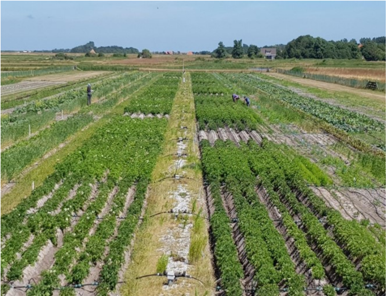
Drought 2018 Irrigation with brackish water