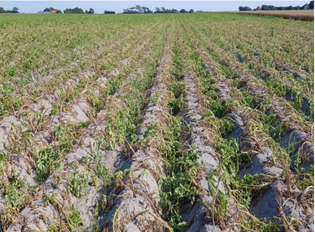
Drought 2018 potato field conventional farming