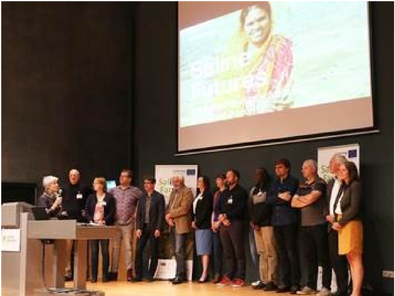
The SalFar team at the welcome session of the conference