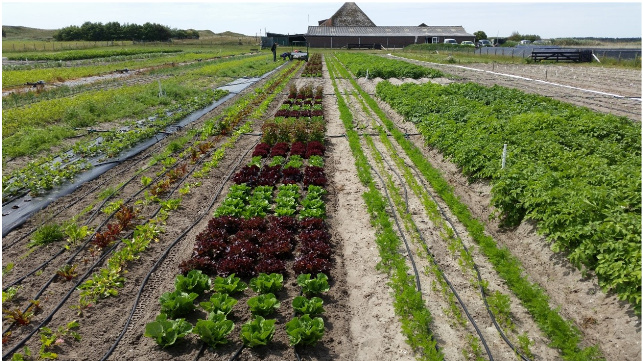
Test field location Texel, Netherlands

The main scientific aim of SalFar is to test the salt tolerance of crops on a large scale. Sixteen open field labs across the partner regions demonstrate innovative farming on saline soil, based on natural adaptation processes in plants and crops. The work is carried out by a multidisciplinary partnership including climate experts, microbiologists, economists, soil experts, entrepreneurs and policy makers. Scientists work closely together with farmers to find practical solutions.