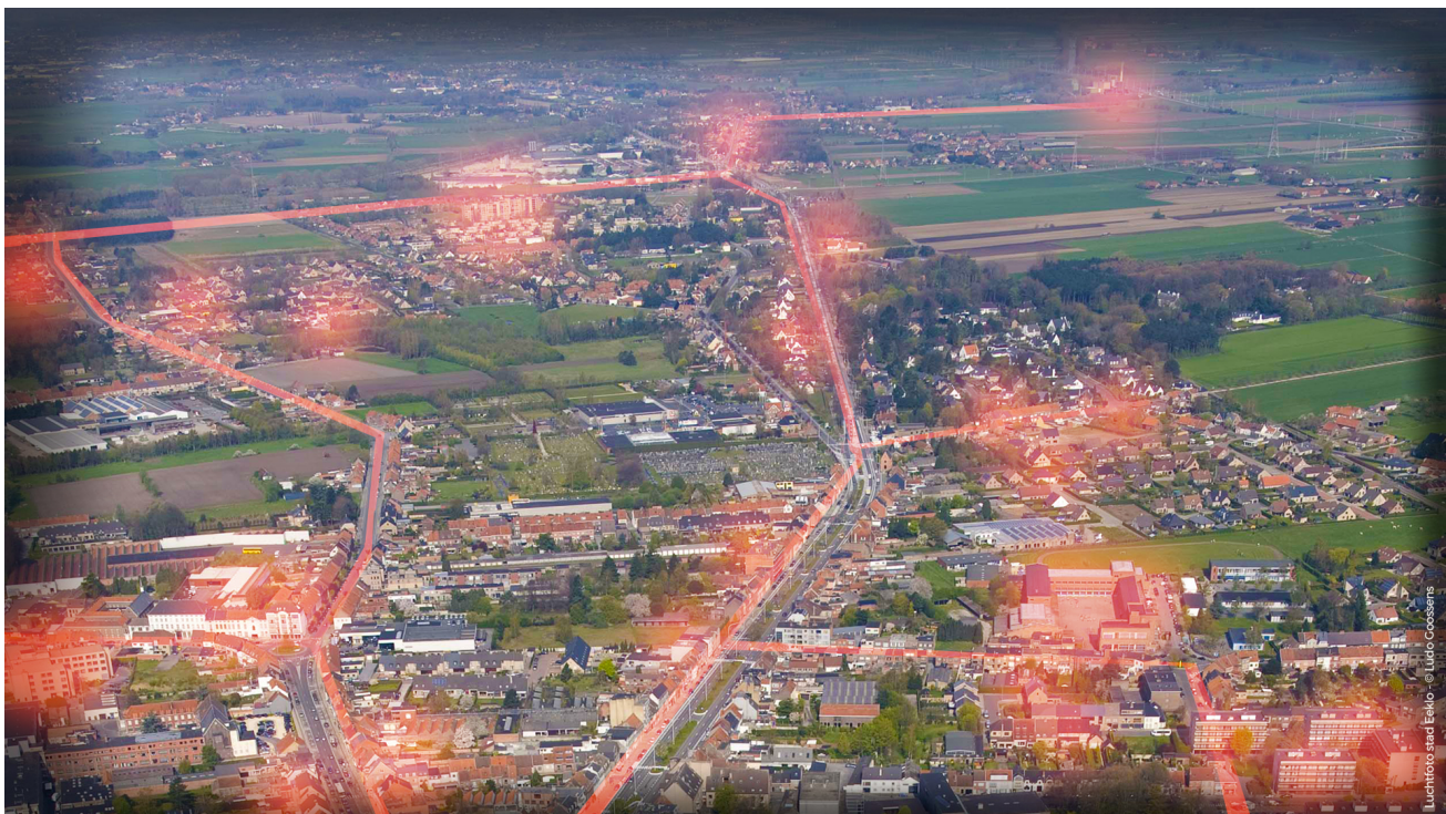
Projected Eeklo heat network

Together with related concepts such as community energy, local and regional energy and energy democracy, CE has become a focus area of clean energy policy. Also, the recent Clean Energy for All Europeans policy has adopted a strong citizen focus, particularly in its governance package [4]. The current focus on CE signifies a growing awareness of its potential to deliver on climate targets.