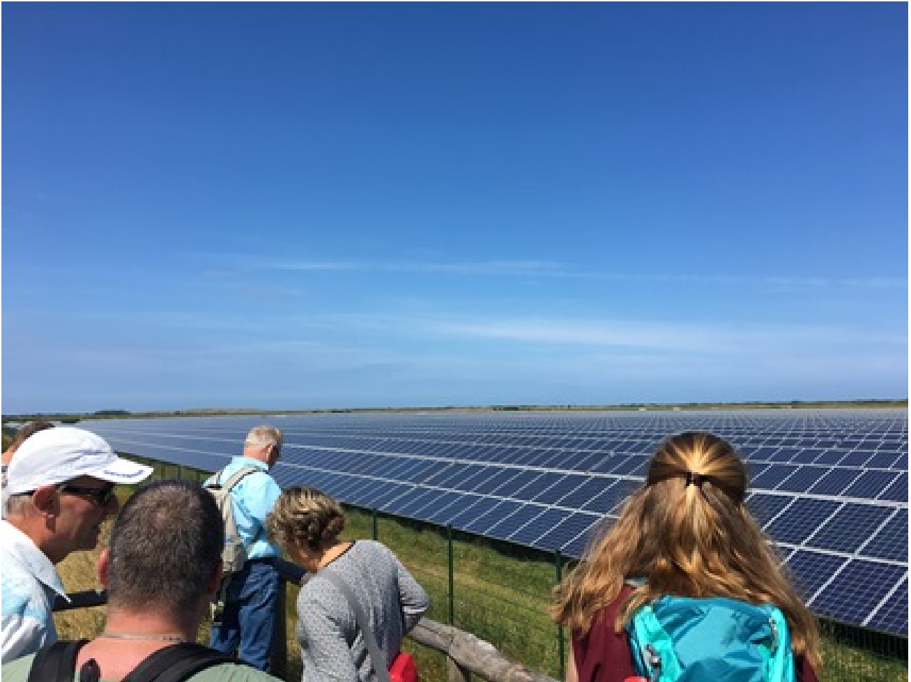
Citizen-owned solar park installation in Emmen, the northeastern Netherlands

We are heading for a transformed energy landscape. The European Commission has adopted a new design of the EU electricity market that introduces a level playing field between all market actors and new rights and opportunities for communities [4] . Much will depend on how the Commission’s recommendations are transformed into national law by the deadline of June 2021.