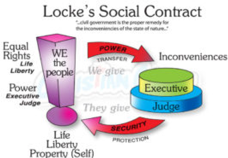
Figure 1: John Locke's Social Contract.

The second take on social contract theory that I use comes from Rousseau's work on the idea of